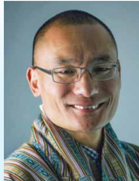
Tshering Tobgay President, People's Democratic Party