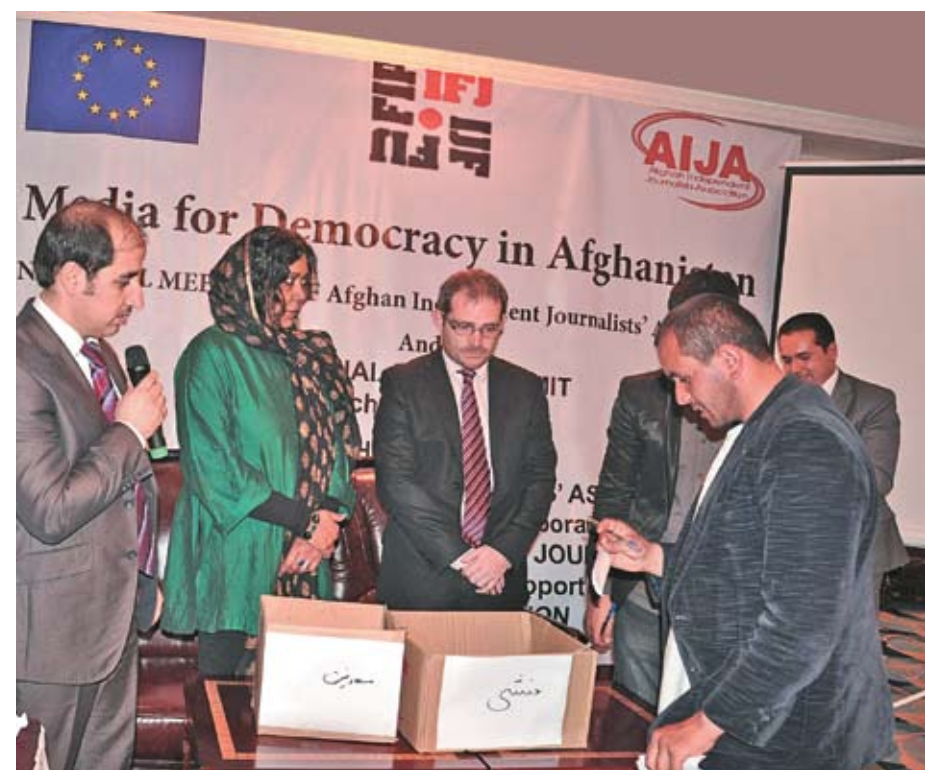
AIJA conducted a national meeting in March 2012 to reaffirm a charter on media freedom and elect a new leadership team (Photo: Courtesy AIJA, Kabul).

roughly about 35 percent of its annual budget, PAN has gained a niche with its bouquet of offerings in three languages: Dari, Pashto and English. Since the early days of Afghanistan's democratic transition, PAN has established a reputation for clear and objective reporting on the actions of even the more powerful figures in the country's political firmament.