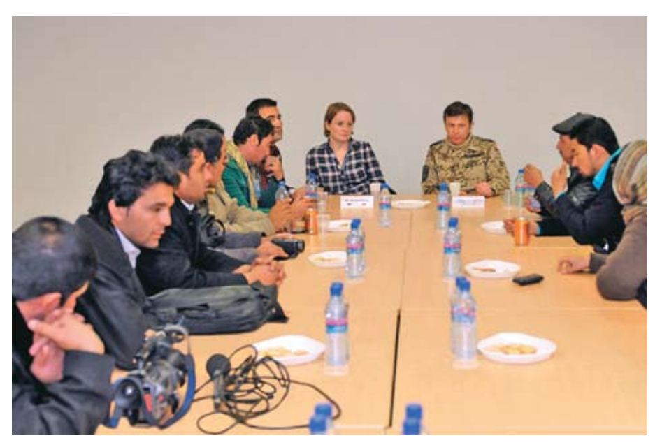
ISAF hosts a discussion on professional matters: western military forces are often held by local journalists to be lacking in transparency.

of a suicide bomber who was taking steps to detonate an IED (improvised explosive device) that posed a lethal threat to numerous soldiers in the immediate area. He shot the individual with his M-4 (rifle), killing him". The ISAF inquiry though, exonerated its armed personnel from any suspicion of wrongdoing. All ISAF staff had complied with the laws of armed conflict and rules of engagement and acted reasonably under the circumstances, it concluded.