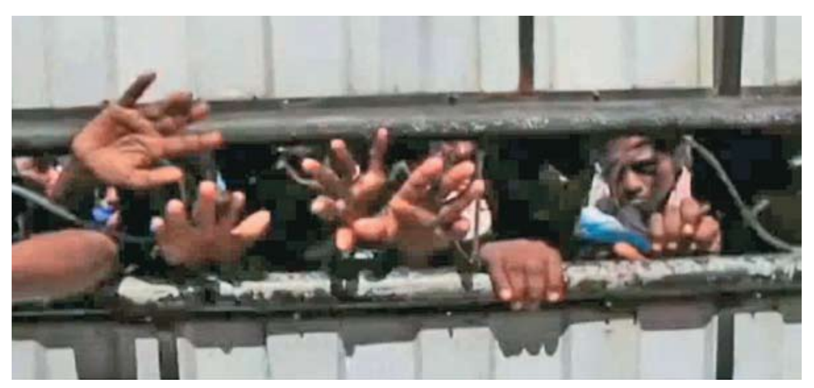
U.K. based Channel 4 documentary, Sri Lanka's Killing Fields, raised worldwide awareness of the human costs of the last phase of the country's civil war (TV grab: Witness/Creative Commons).

old footage of these journalists and activists from past campaigns, the TV channel ran a commentary on its main news programmes, attacking them in virulent terms.