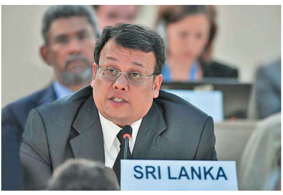
Sri Lanka representative at the UNHRC: a resolution adopted by the body in March led to fresh acrimony within the country over the role of media freedom activists.

The government-controlled ITN TV channel was right from January 2012, a platform for severe verbal assaults against journalists and human rights defenders. Between January 9 and 24, the channel carried no fewer than five programmes in its daily slot titled "Vimasuma" attacking journalists who had been present during the nineteenth regular session of the UNHRC, for having allegedly "betrayed" the country. Vivid and graphic Photo-montages were circulated by various political actors, which represented