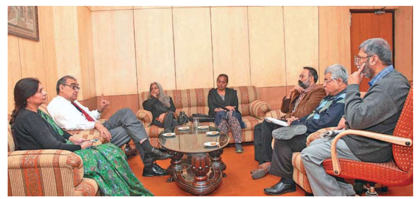
Justice Markandey Katju meets with a delegation of the Delhi Union of Journalists shortly after taking office as chairman of the Press Council of India.

Journalists are wary about any prior conditions on modes of media reporting. Though not explicitly disallowed, any form of prior restraint is seen as contrary to the article 19