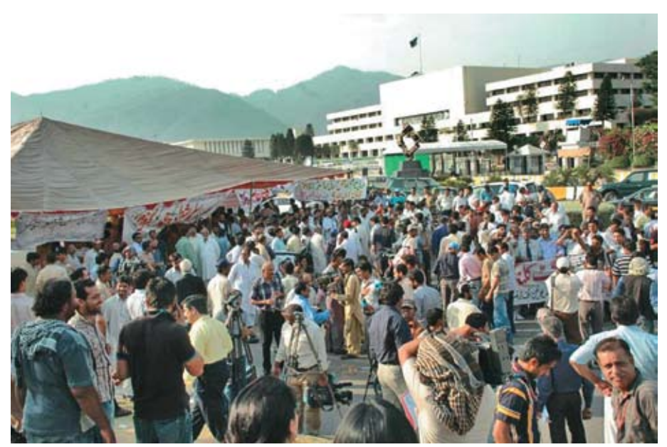
A day and night protest by the PFUJ persuaded the authorities to quickly agree on the composition and terms of reference of a judicial inquiry into the Shahzad murder.

Shahzad murder in this sense, was a key event. As hundreds gathered for his funeral on 1 June, journalists' unions affiliated with the PFUJ raised black flags and conducted condolence meetings with human rights activists and civil society groups countryside. The PFUJ joined a number of other organisations of journalists and press freedom advocates from around the world, to issue a joint letter, appealing to the Government of Pakistan to quickly implement all appropriate measures to protect media personnel and to prosecute murderers of journalists in Pakistan. The letter addressed to both President Asif Ali Zardari and Prime Minister Yousuf Raza Gilani, noted that Pakistan's toll of dead and injured journalists and media workers placed the country ahead of Iraq and Mexico as the world's most dangerous place for journalists. "We fully appreciate the great difficulties confronting all people in Pakistan at this time. However, we also know that Pakistan has the resources and expertise to conduct credible investigations into murders of journalists and to bring culprits to justice," the letter said.