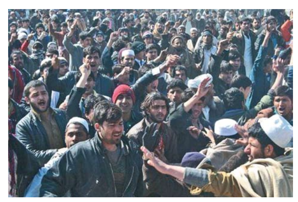
The protests that broke out in February over allegations of desecration of the Islamic scripture led to new uncertainties.

As recorded in a comprehensive study on the status of the Afghanistan media, published by the U.S. Agency for International Development (USAID) in October 2010, media managers in the country are often known to use terms such as "gang media" to identify news organisations serving the personal and political interests of former warlords or other major power-holders in the Afghan system. With these beliefs being widely held, there is often considerable scepticism about the integrity of news and information,