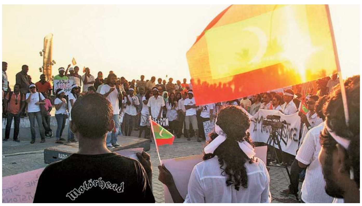
A protest against the detention of members of parliament after the February political turmoil (Photo: Dying Regime/Creative Commons).

its inquiries, that this attack was carried out by a group that went into the station when it was broadcasting live footage of clashes between the MDP and opposition.