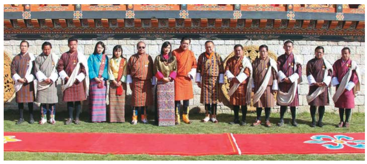
In December 2011, the government of Bhutan honoured a number of citizens including media persons with the National Order of Merit (Photo: Dorji Wangchuk).

Editors of private newspapers had proposed that the government discontinue the stipulation that they carry Dzongkha editions of their English language papers. They say that this has become a "huge financial burden" and was having a serious negative impact on sustainability of media, while not serving the government plan to promote the national language. Media houses have invested heavily in Dzongkha, but for very meagre returns in terms of increased readership. As part of their cost cutting strategies, the papers have now turned Dzongkha editions into inserts to their main publication to meet the formal stipulation while keeping costs low. They rarely keep an