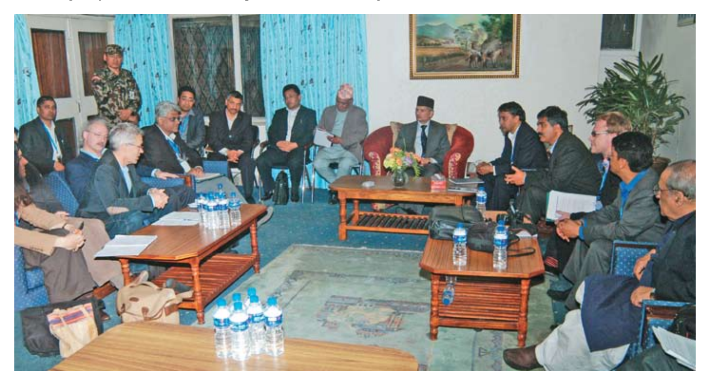
At a meeting with the International Media Mission to Nepal in February 2012, Prime Minister Baburam Bhattarai committed himself to strong free speech clauses in the constitution.

According to the FNJ, the recent media boom in Nepal has created favourable conditions for professionals within newspapers and broadcasters catering to the upper income demographic strata, which are generally favoured by the high-value advertisers. However, the situation for the vast