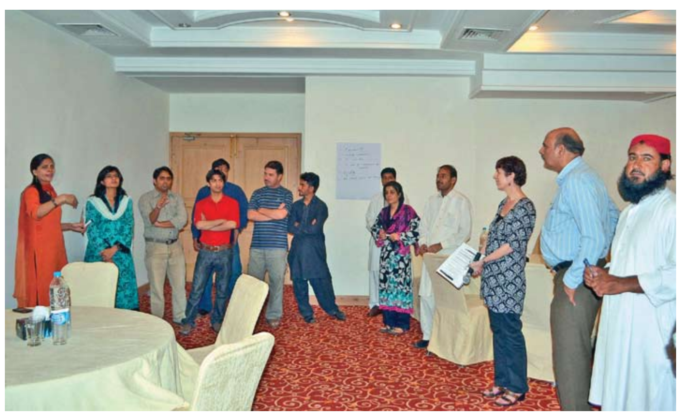
The PFUJ has heightened collaboration with international partners including the IFJ, in raising awareness of safety issues and media rights.

of the Chief Justice. Following an application filed by the PFUJ counsel before the bench of the Chief Justice on 19 June and a concurring submission from the Government, a formal notification of the commission of inquiry was made. A key moment in its deliberations came on 27 September 2011, when Brigadier Zahid Ahmad Khan, ISI sector commander, submitted a written statement to the commission and answered questions in camera . The report of the commission when it was finally submitted on 10 January 2012, disappointed many in its failure to identify any specific suspect behind Shahzad's murder (see box).